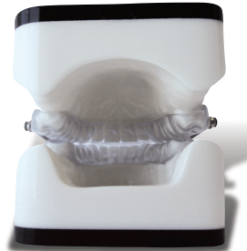
Back View Of The TSA